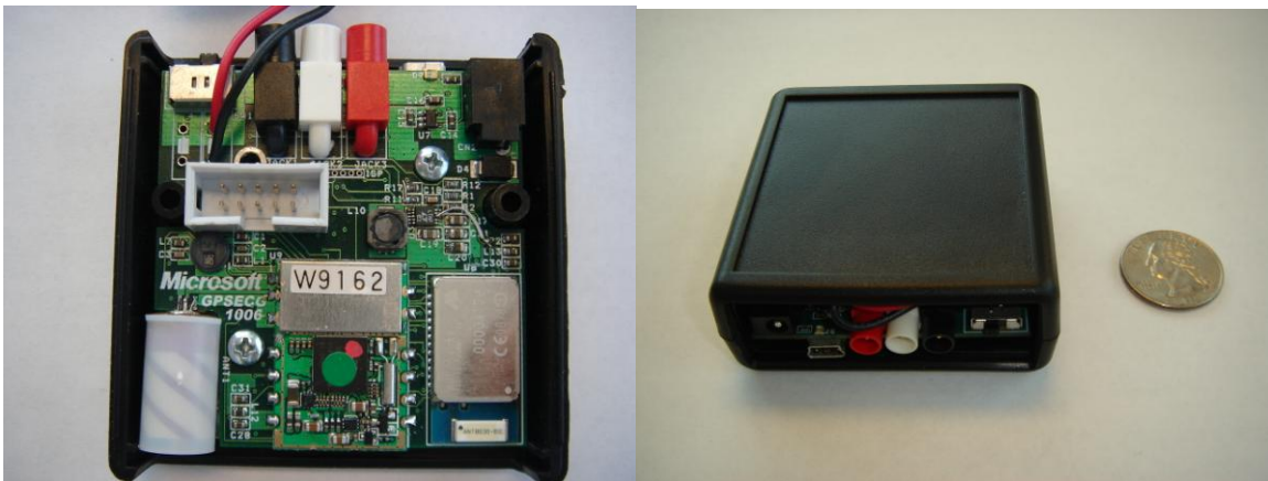
Figure 1. Prototype sensor board that includes GPS, accelerometer, pressure sensor, temperature, Bluetooth, and battery.

Signal inputs are transmitted over Bluetooth from the SlamXR sensor board to a Windows Mobile device. Some signals require only simple translations, such as converting temperature to centigrade or extracting latitude and longitude from the NMEA string produced by the GPS radio. Others require additional data processing. Primarily this includes extracting heart rate in beats per minute from the heart rate monitor, which uses an algorithm similar to [12], and both absolute and net amount of acceleration along each axis from the accelerometer. After any necessary